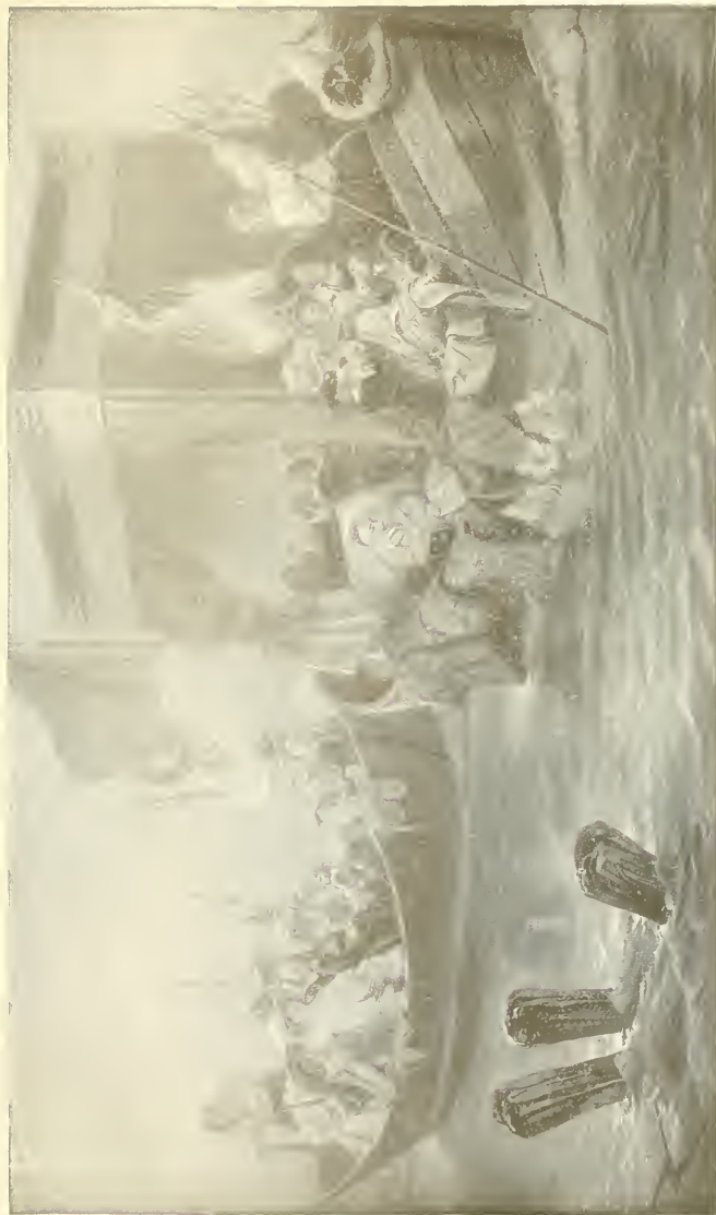
CONDUCTING CINQ-MARS AND DE THOU TO LYONS TO BE BEHEADED