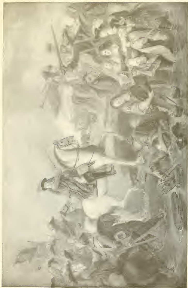
FROM PAINTING BY WEST